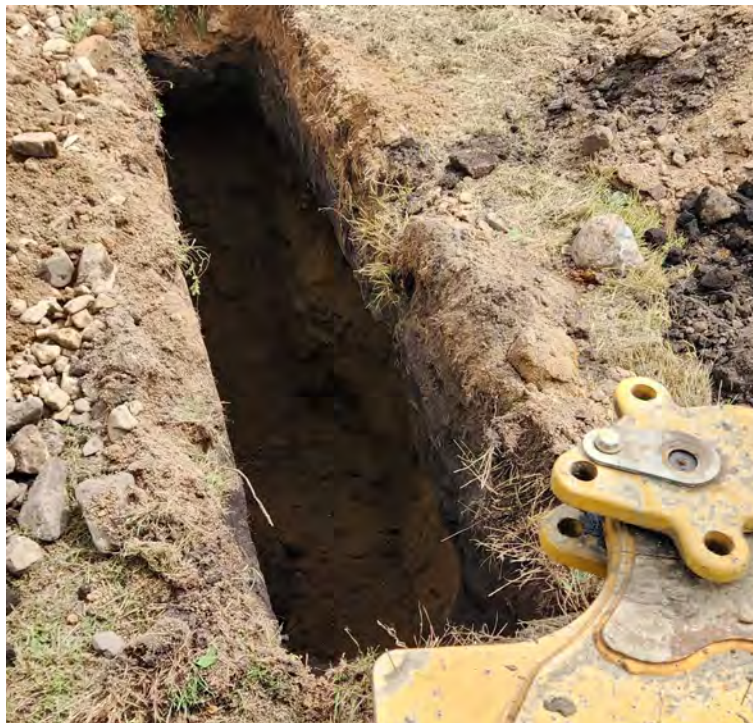
TPL-09 - 1: Test pit excavation - sidewall collapse occurring at depth of water inflow